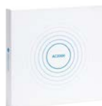
AC2000, AC2000 Airport AC2000 Lite