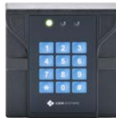
sPass DESFire smart card reader sPass DESFire smart card reader with keypad