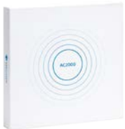
AC2000 AC2000 Airport