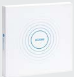
AC2000 AC2000 Airport