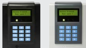
S610 Intelligent Card Reader/Controller