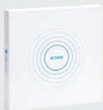
AC2000 AC2000 Airport