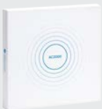
AC2000 AC2000 Airport