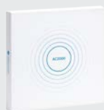
AC2000 AC2000 Airport