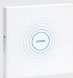
AC2000 AC2000 Airport