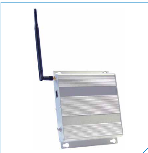
CEM SMS Finder

Designed with ease of use in mind, the CEM SMSFinder module simply requires a standard SIM card to be inserted and then the AC2000 and Webentry II Pro systems will be able to notify designated users of important or critical events within the security system.