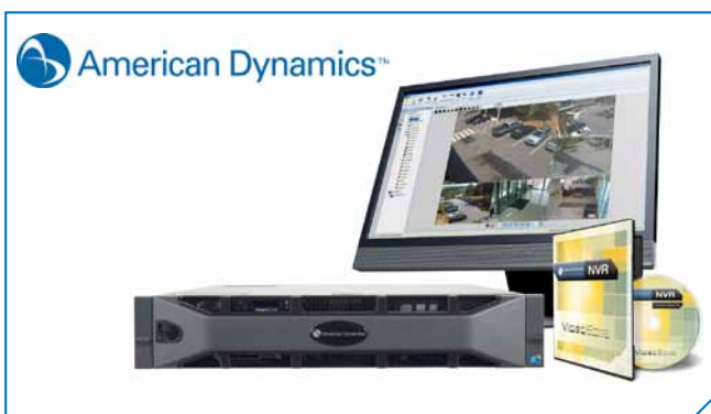
AC2000 VideoEdge NVR Interface

VideoEdge is a high-performance NVR that supports multi-channel audio and dual streaming for a robust enterprise video management solution.